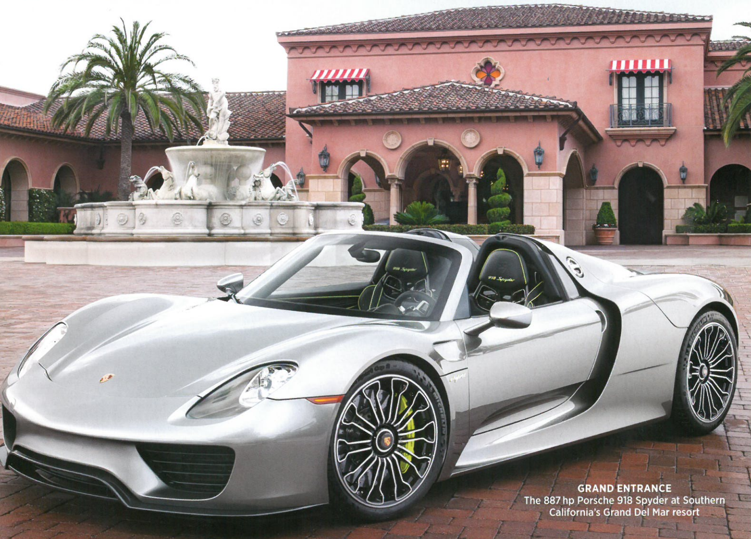
GRAND ENTRANCE The 887 hp Porsche 918 Spyder at Southern California's Grand Del Mar resort

ANGUILLA | BOTSWANA | MALDIVES | MONTANA | PATAGONIA & MORE